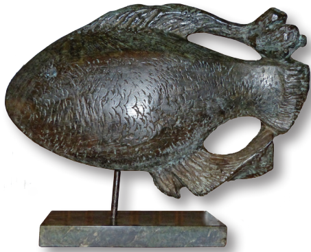
"MOONFISH" by Lorrie Goulet Bronze ed. 3, 10" x 13" x 4", 1975