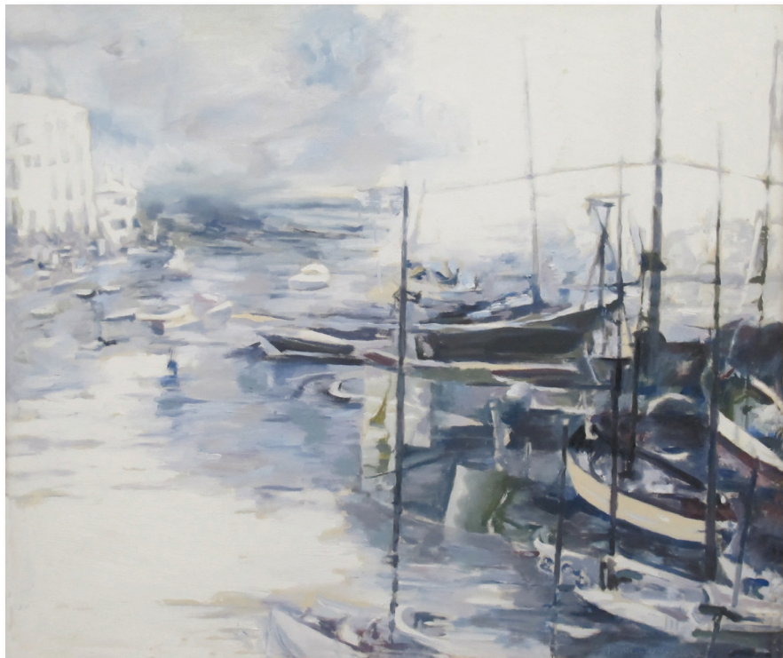
"BOATS AT ANCHOR" by Balcomb Greene Oil on canvas, 34" x 40", 1967