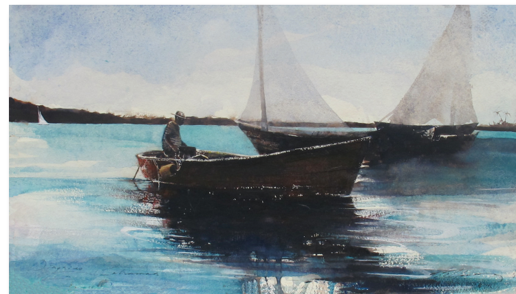
"DINGHIES, BAHAMAS" by Stephen Scott Young Watercolor, 8" x 14", 2012

Following this exhibition, the Harmon-Meek Gallery will be open by appointment only until November 1st. Our new location, Harmon-Meek|modern will remain open through the summer months.